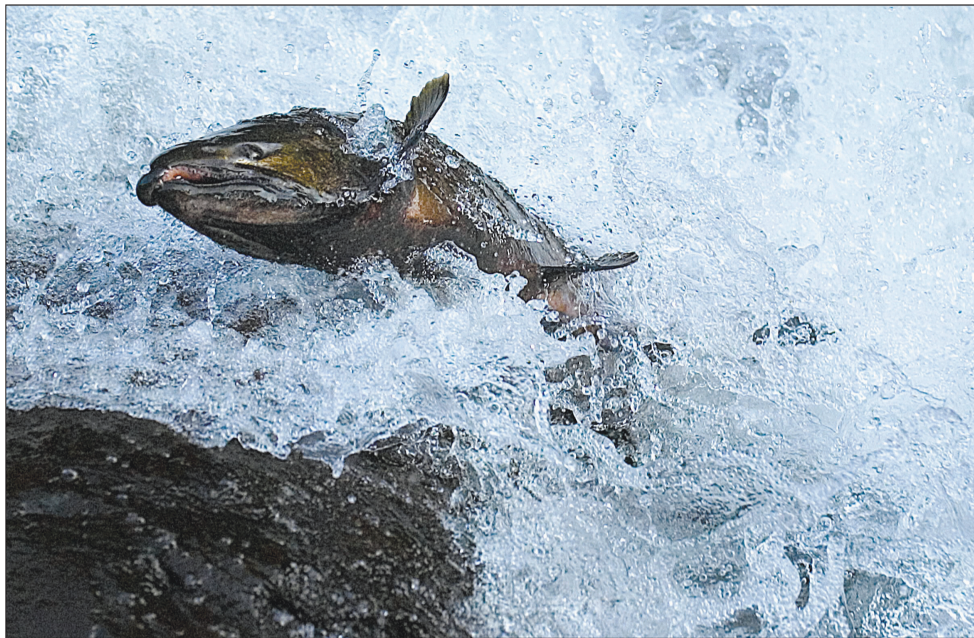
One of the thousands of salmon returning to spawn this month in creeks and rivers in Southwest Washington. This photo was shot recently at Salmon Falls on the Washougal River.