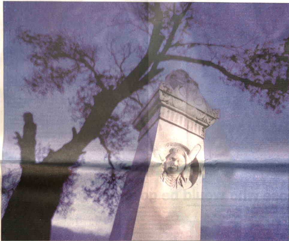
This 19th century Indian leader gave his most memorable speech in defeat, then was exiled to a Washington reservation ... Page C1.