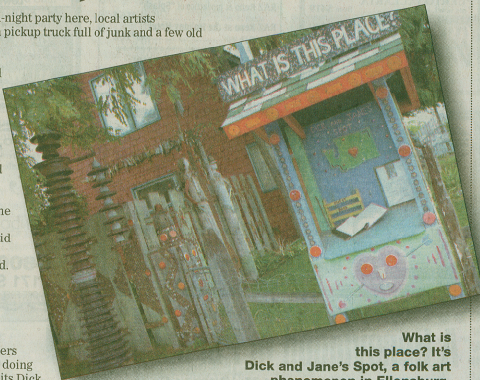
What is this place? It's Dick and Jane's Spot, a folk art phenomenon in Ellensburg.

In this collection, The Columbian looks for answers for Washingtonians, native and newcomer alike. In doing so, we forgo the familiar for the fringes of the state: its Dick and Jane's; its cultural junk and jewels.