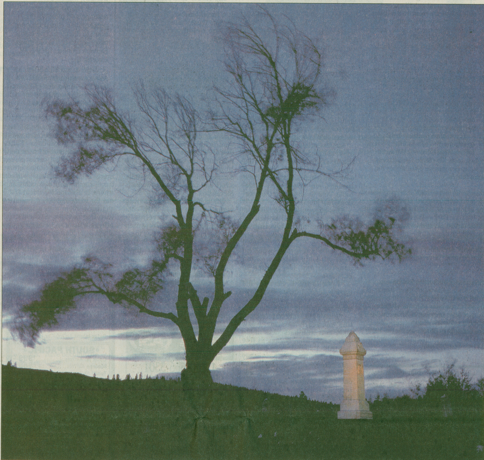
Chief Joseph's life ended in exile in Nespelem, a city on the Colville Indian Reservation, 12 miles north of Grand Coulee.