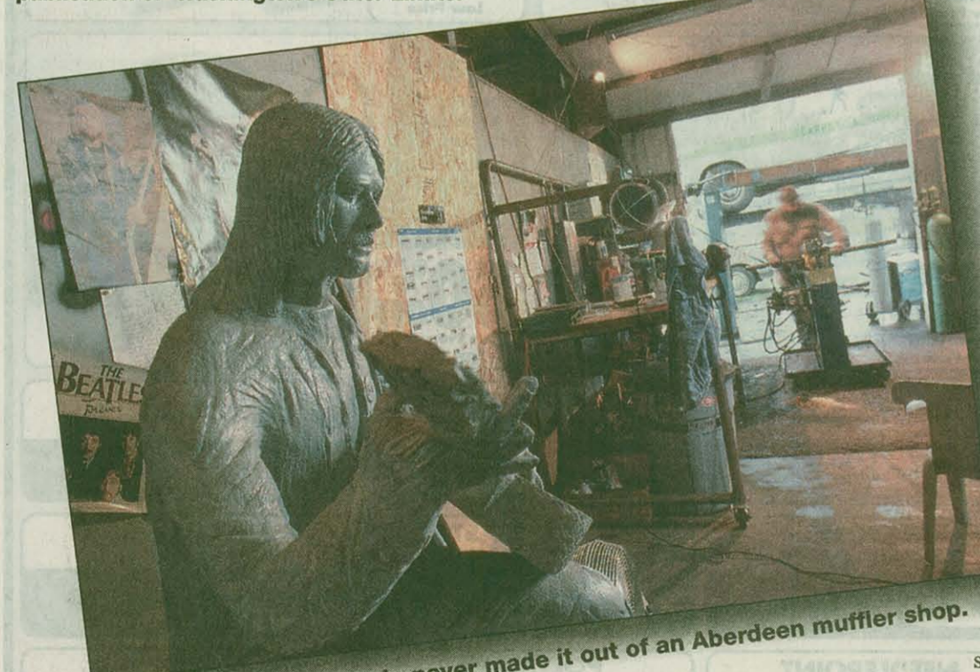
This statue of Kurt Cobain never made it out of an Aberdeen muffler shop.

INFO-LINE We'd like to know your favorite Washington person, place or thing. Call us at 699-6000, ext. 7065 and leave your full name, phone number and response. We will print a variety of the suggestions in a special upcoming publication of Washington's Outer Limits.