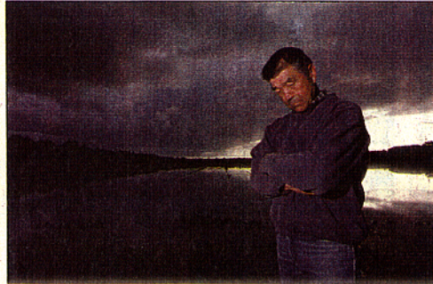
Flood: Recent growth around the Ono farm has contributed to flooding problems.