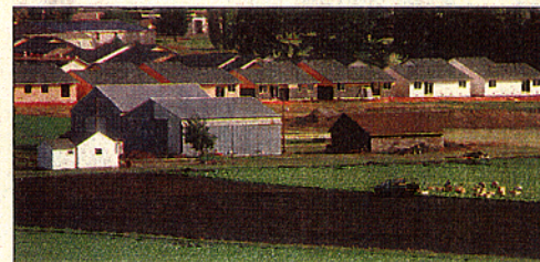
Development: New homes slowly push up like weeds around the Ono farm, bringing with them a change in the landscape of what was once a rural farm community.