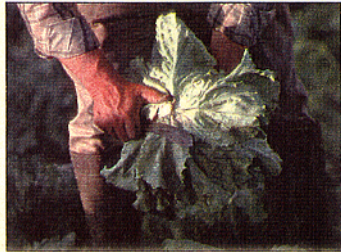
Harvest: Harvesting lettuce usually begins at 5 a.m., depending on the number of orders that need to be filled.

From poverty to racism to growth, the Onos have fought to keep their farm for 50 years