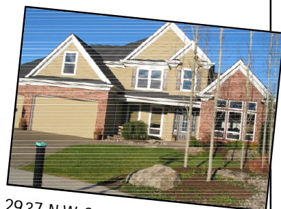
2937 N.W. Conrad Court