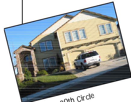
2803 N.W. 30th Circle