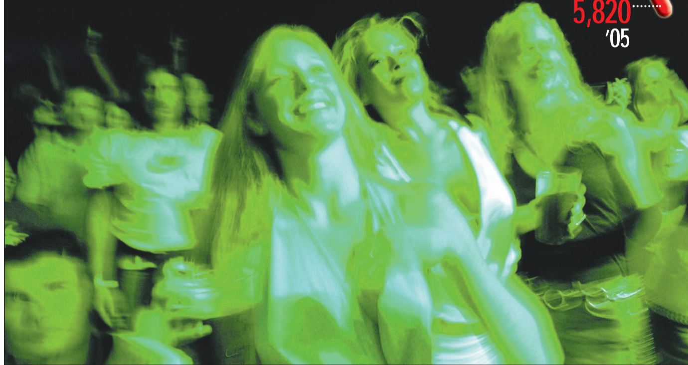
The Columbian files